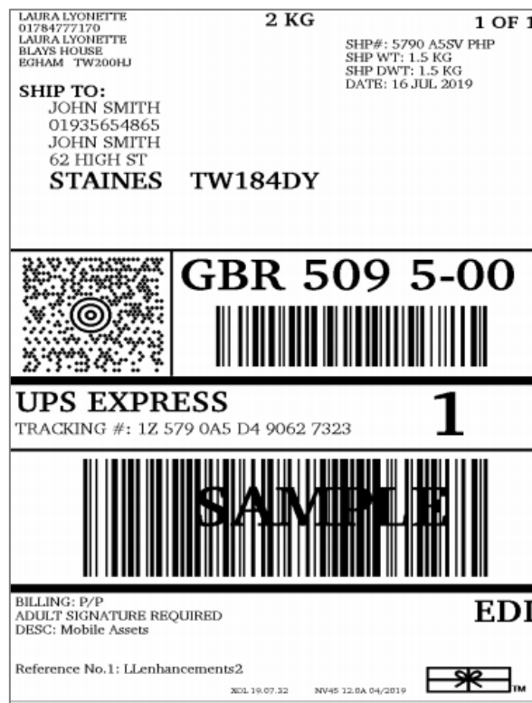
Figure 9: Example UPS label with 'Adult Signature Required' service enhancement (in bottom left corner)

NOTE: The service enhancement(s) may not be indicated on the label, depending on the type of enhancement(s) used. For example, enhancements relating to delivery instructions such as Saturday delivery or adult signature required on delivery are usually shown on the label, whereas SMS or email notification enhancements are not.