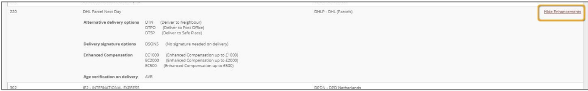
Figure 2: View Service Enhancements link selected